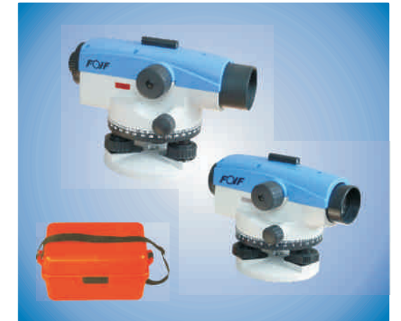
Carrying case and different color level

*Depending on staff and levelling technique