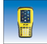
F58 GNSS Handhelder