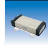
A100 Reference Receiver