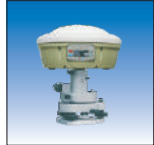
A3 Static Receiver