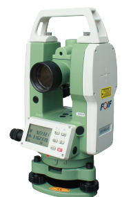
DT402-Z Auto-collimating theodolite